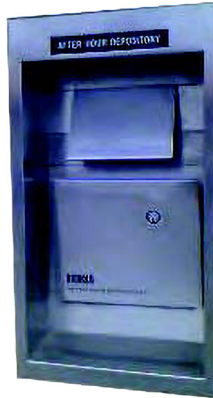
Kit # B6406 Polaris