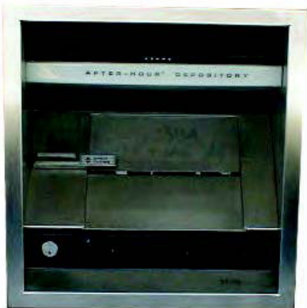
Kit # 96-451 Securomatic