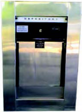
Kit # B6379 American