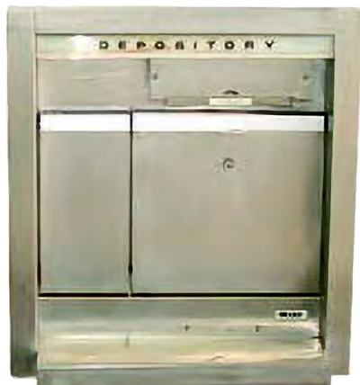
Kit # 96-450 Magna Duel